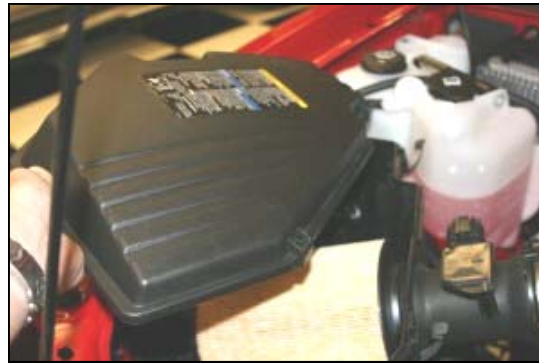
2. Remove the factory airbox lid, and set it aside.