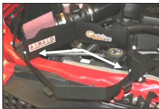
5. Assemble the Quick Fit panels (#2&#3) using the four 6-32x5/16" screws (#5), #6 washers (#7), and nuts (#6).