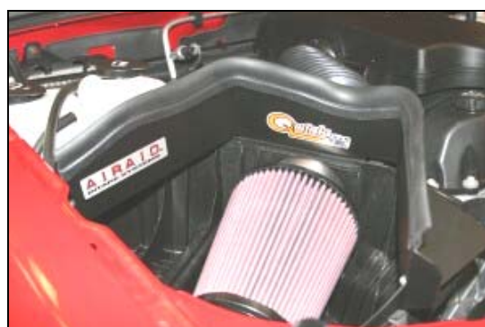
8. Install the provided weather strip (#4) on the top of the Quick Fit panels. For ease of installation, start next to the fender and work your way towards the front of the vehicle.