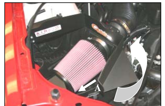
6. Install the Quick Fit panels by inserting the tab on the front of the panel into the front slot of the factory airbox base (A), and then rotating the panels counterclockwise.