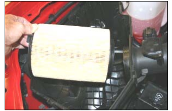
3. Remove the factory air filter, and set it aside.