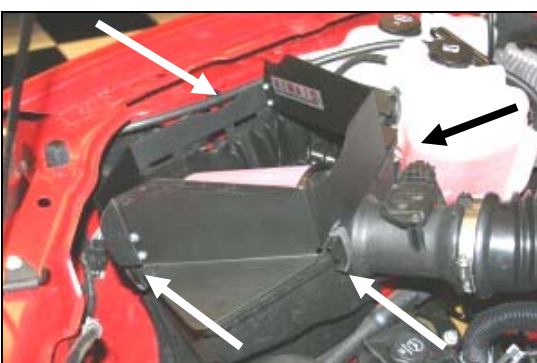
7. Make sure the second tab is aligned in the rear slot of the factory airbox, and then adjust the Quick Fit panels to fit squarely on top of the airbox, and then relatch the three factory clips.