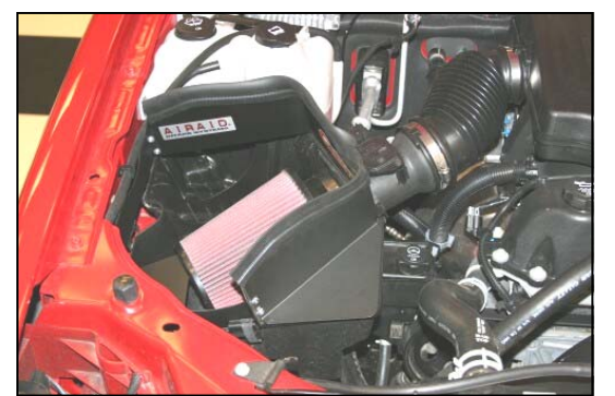
9. Congratulations on installing your new intake system! See the back of this page for further instructions.