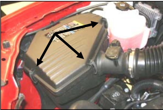
1. Disconnect negative battery cable. Unlatch three clips that hold down the factory airbox lid.